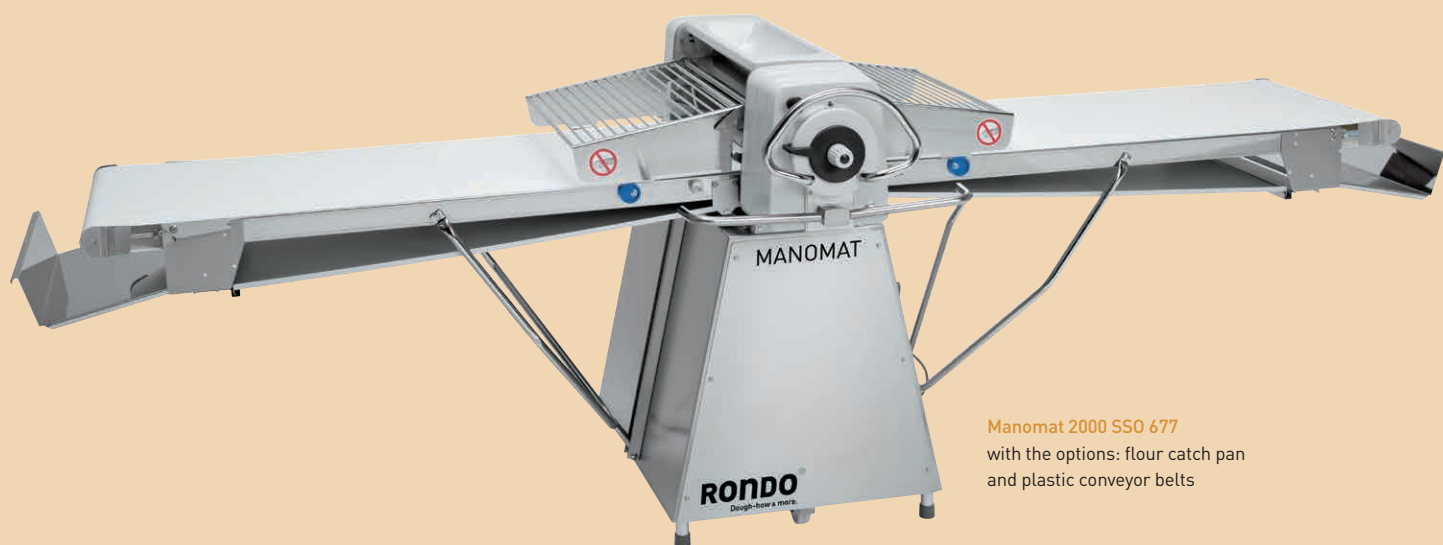
Manomat 2000 SSO 677 with the options: flour catch pan and plastic conveyor belts

With the Manomat and Automat, you quickly process particularly large quantities of dough. You can also work effortlessly in multiple shifts. Numerous elaborate details ensure maximum operator convenience. The design is extremely rugged and smooth surfaces made of stainless steel make cleaning simple.