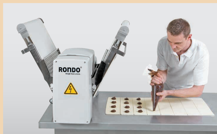
When not in use, the tables are simply folded up and you gain valuable working space.