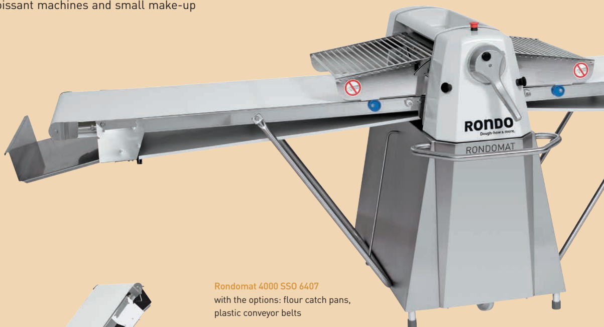
Rondomat 4000 SSO 6407 with the options: flour catch pans, plastic conveyor belts

The Rondomat is the right dough sheeter for small to medium-sized bakeries. It features a rugged and ergonomic design. With the Rondomat, you process all types of dough gently to form consistent blocks and bands of dough. The working width of 650 mm even allows you to feed cutting tables, croissant machines and small make-up lines.