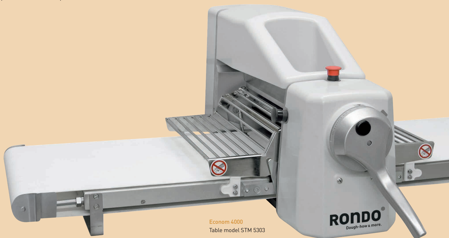
Econom 4000 Table model STM 5303

The Econom sheets dough gently and precisely and only uses a minimum of space. With its 500 mm working width, it is the ideal dough sheeter for narrow areas, for example in hotels, restaurants, pizza shops, canteen kitchens, and artisanal bakeries and confectioners.