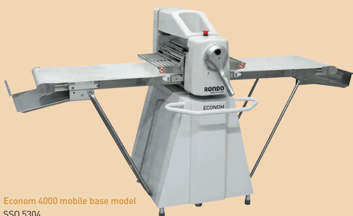
Econom 4000 mobile base model SSO 5304